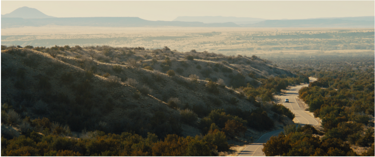
IDLE SPEED (2023)